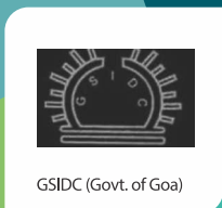
GSIDC (Govt. of Goa)