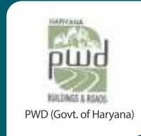
PWD (Govt. of Haryana)