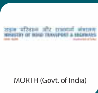
MORTH (Govt. of India)