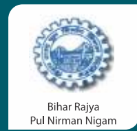
Bihar Rajya Pul Nirman Nigam